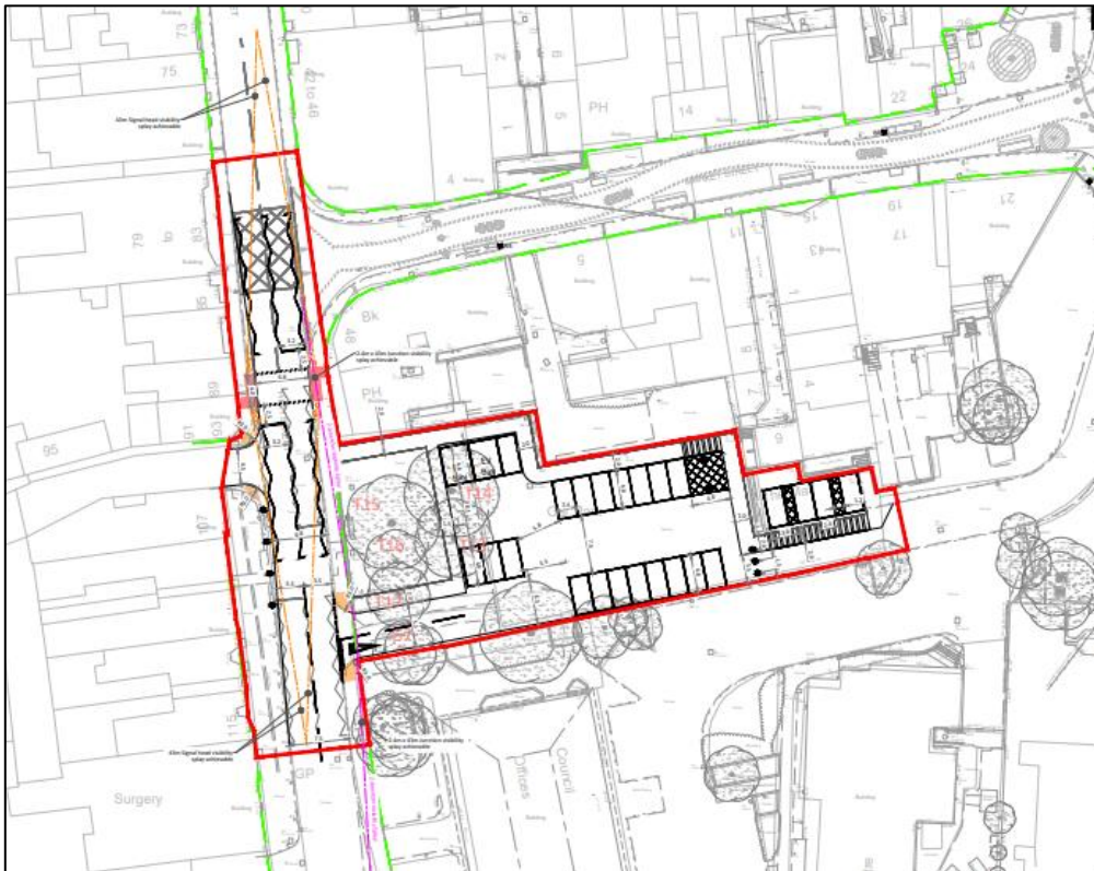
Figure 1: Location plan, with site edged in red

MAIN RECOMMENDATION: Grant permission, subject to conditions