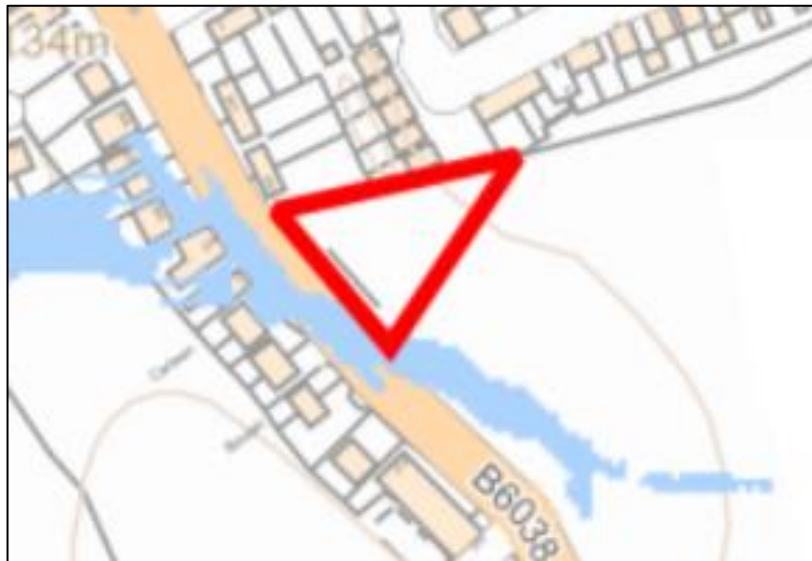
Figure 5: Extent of low risk of surface water flooding on Chesterfield Road