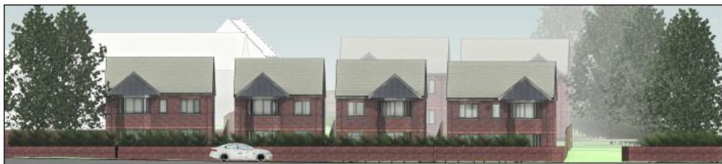
STREET SCENE ELEVATION SCALE 1:500