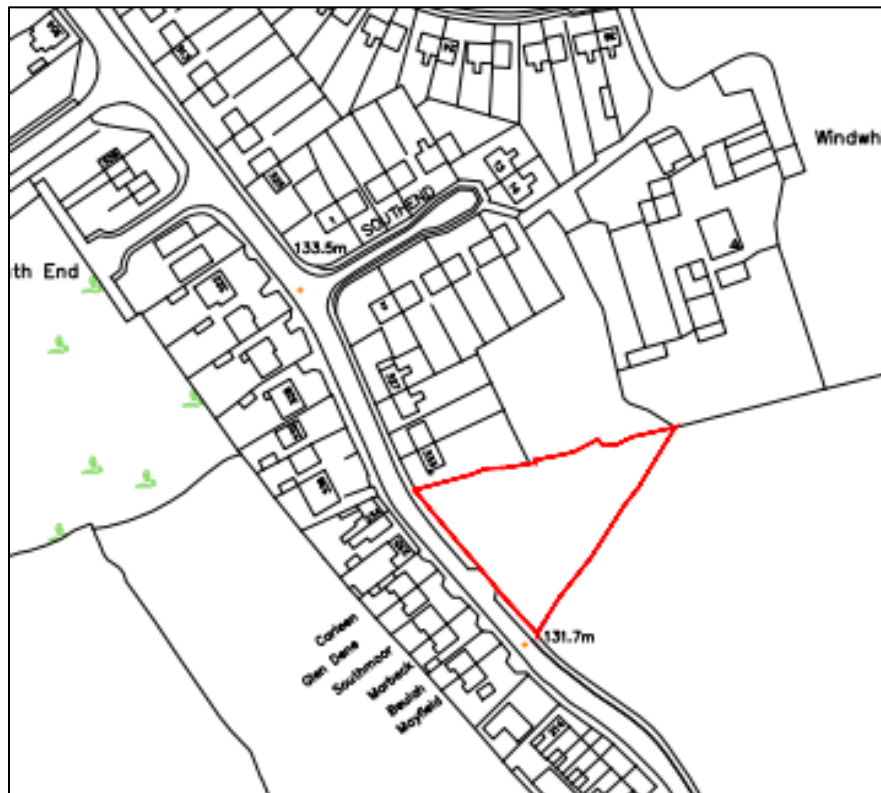
Figure 1: Location plan, with site edged in red

MAIN RECOMMENDATION: Grant permission, subject to conditions