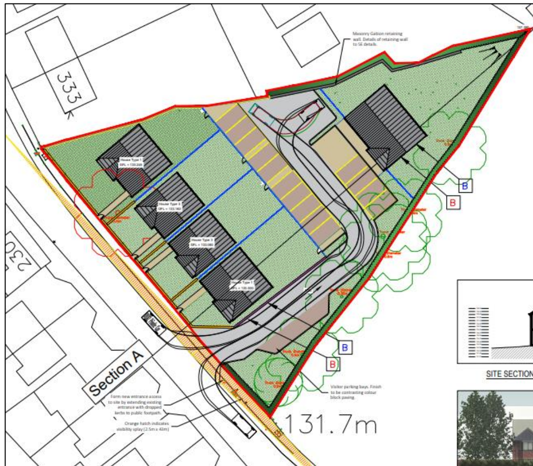
Figure 2: Extract of proposed site layout (taken from drawing PL_01 Rev F)