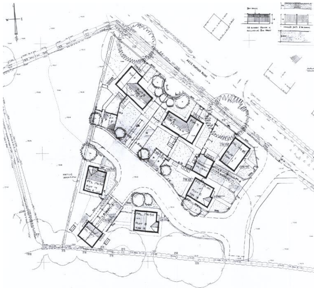
Figure 4: Extant Layout