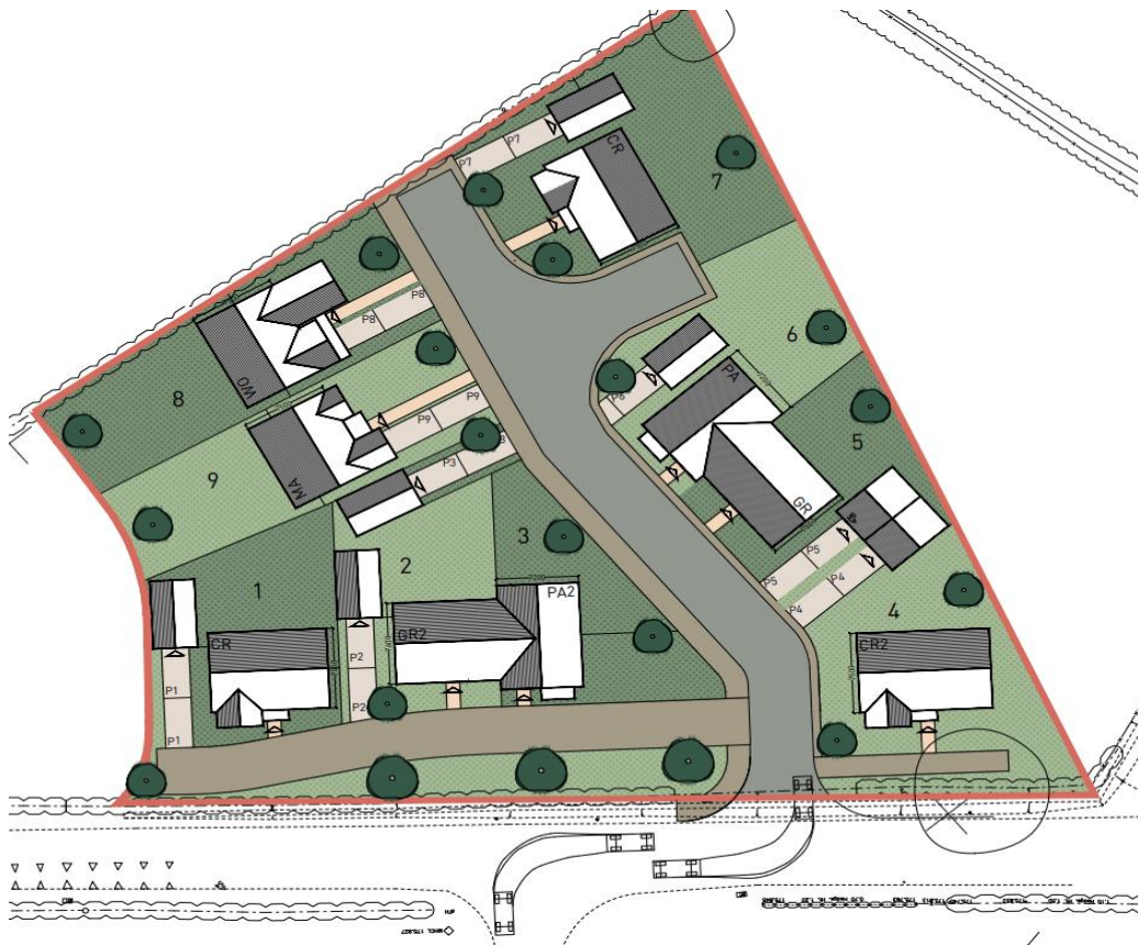
Figure 2 : Revised and amended layout