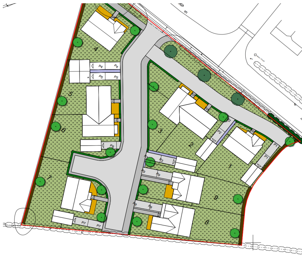
Figure 3: Landscaping masterplan