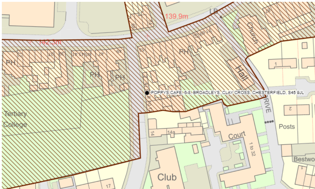
Figure 5: Extent of Clay Cross Conservation Area (hatched brown)