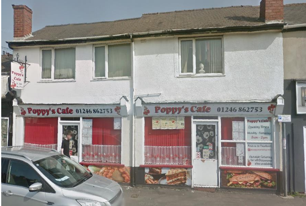
Figure 3: Shopfront April 2019