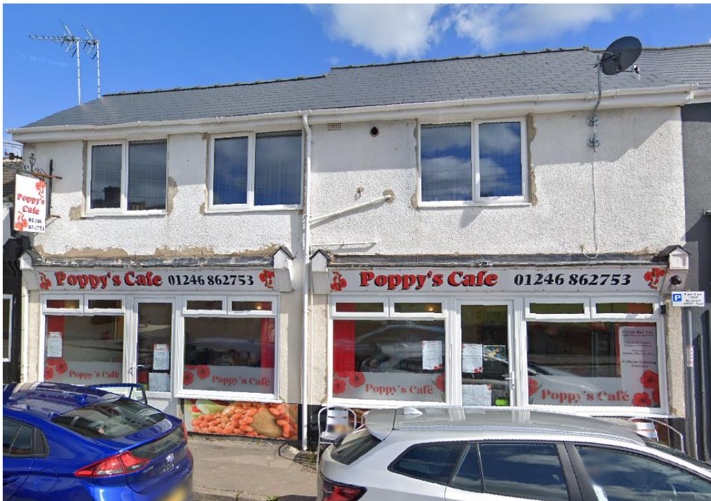
Figure 4: Shopfront taken from Google maps April 2023