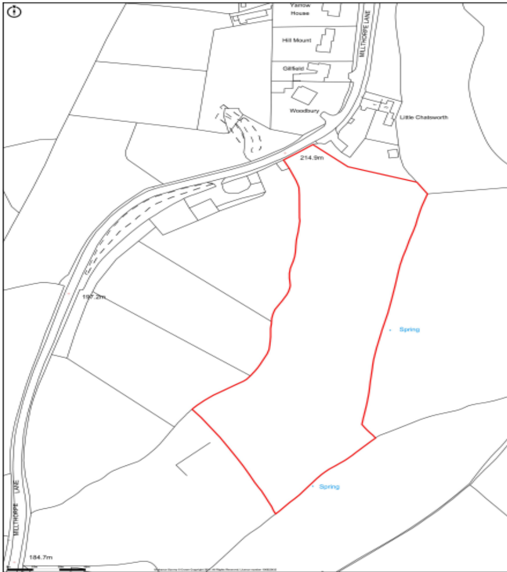
Figure.1 Application site