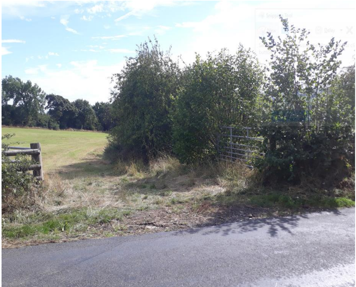
Figure 4: Existing Access arrangements