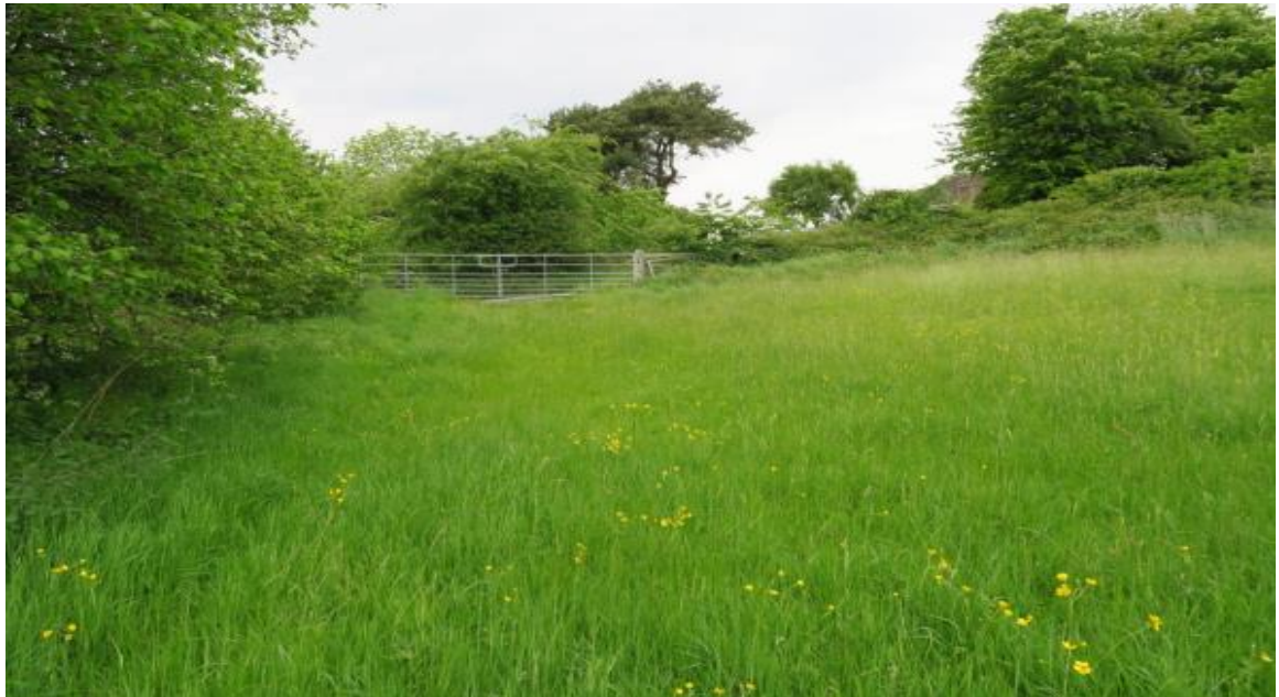
Figure 3: View towards the site access and Millthorpe Lane (Taken from the submitted Design and Access statement)