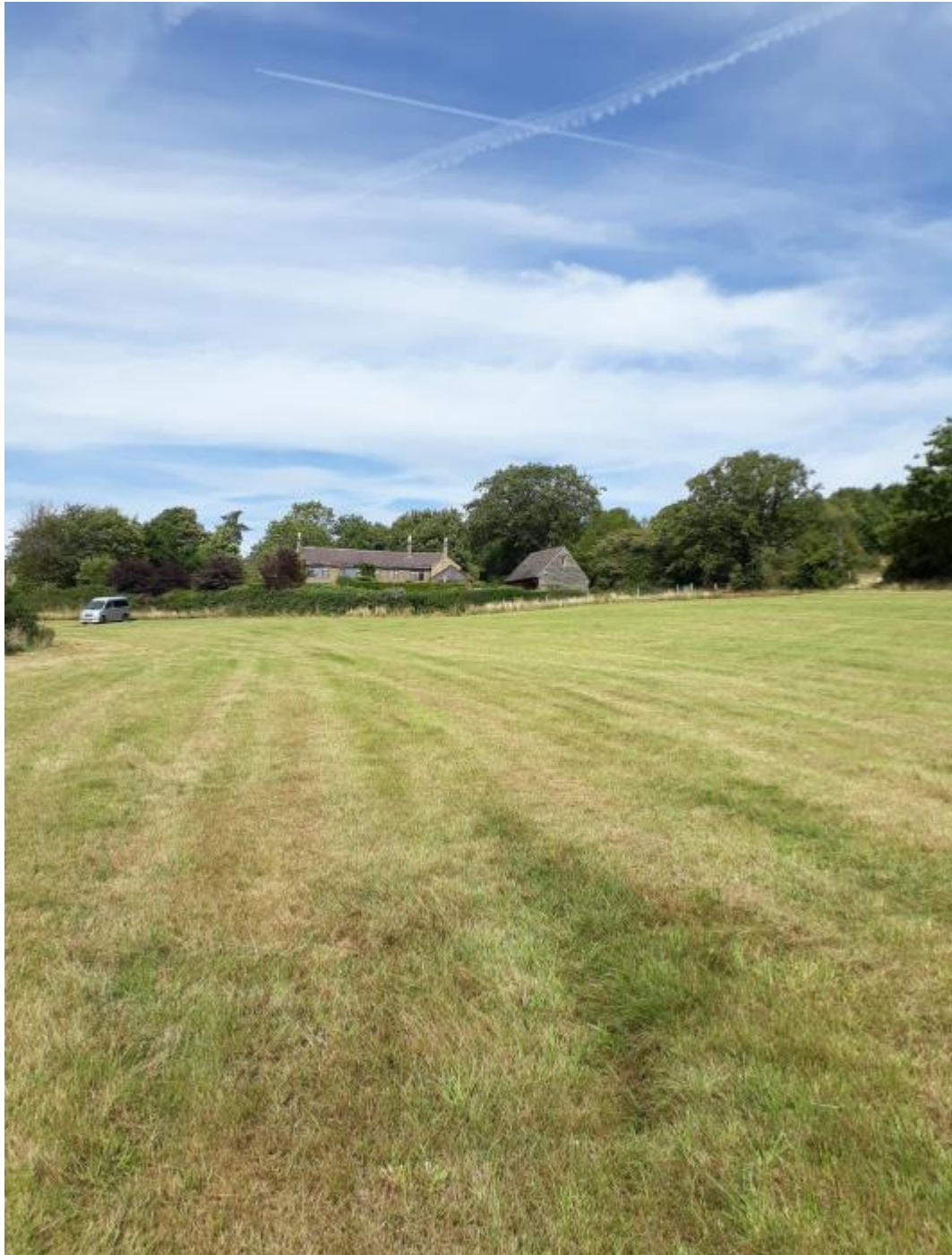
Figure 2: Application site