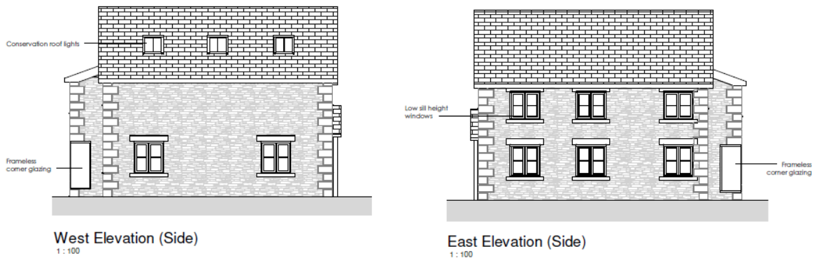
Figure 1: Approved scheme 20/00079/FL

The Officer report sets out the alterations between the approved dwelling and that now partially constructed. They should also identify that on both the east and west elevations a single window is removed (see below previously approved scheme and that under consideration).