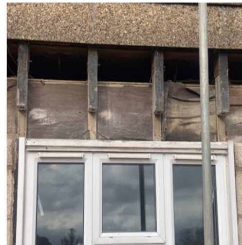
Columns are removed