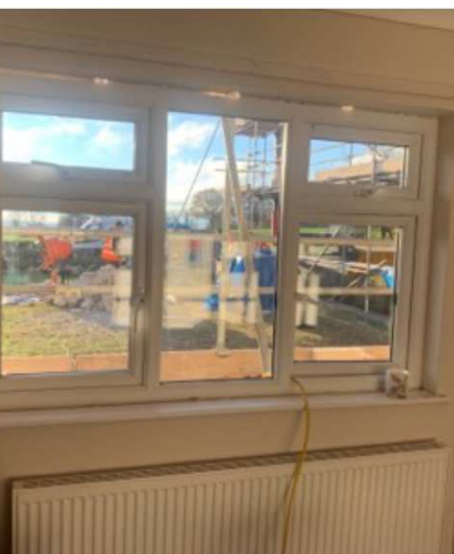
New Windows are fitted