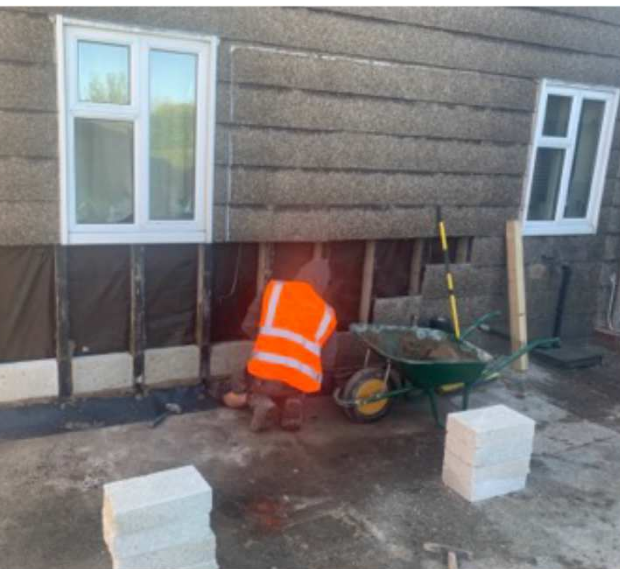
ing panels are removed