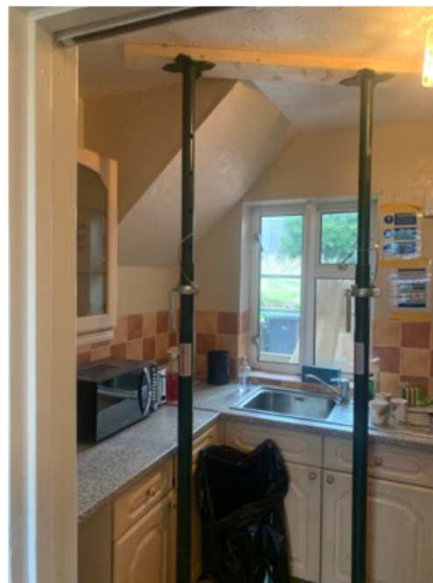
* Airey house types only internal props are required as part of the structural works for 24 hours