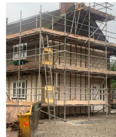
Scaffold is erected for high level work, access is maintained for the customers

An example of the journey of works taking place