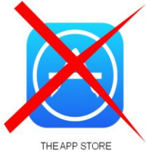
THE APP STORE