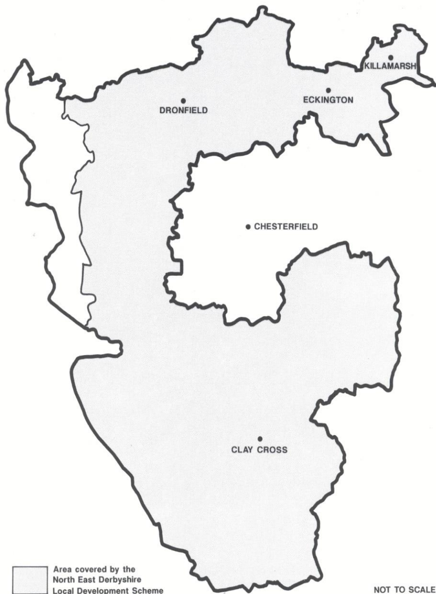
Figure 3: Geographical Coverage of the North East Derbyshire Local Development Scheme.

3.5 The geographical extent of the District's LDS is illustrated in Figure 3 and coincides with the local planning authority area of North East Derbyshire. This covers the whole of the District with the exception of the north western fringe of the District, which falls within the Peak District National Park. The Peak District National Park Authority is the planning authority for the National Park and publishes a separate LDS. In addition, Derbyshire County Council as waste and mineral planning authority prepares its own DPDs to deal with these issues.